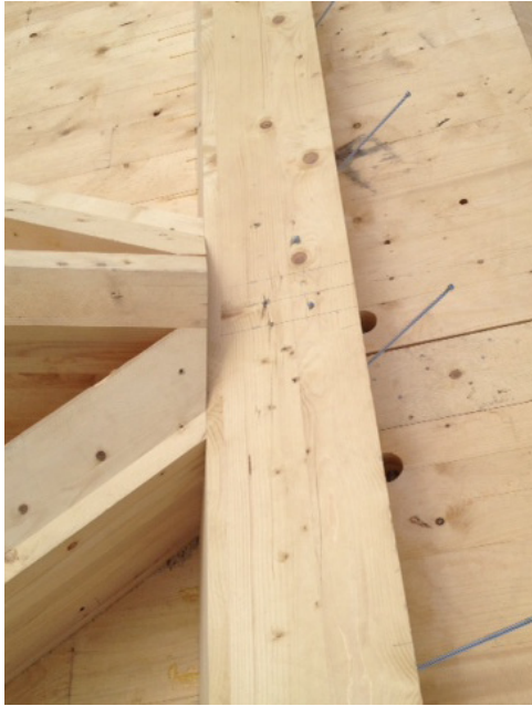
Buschmann Residence, Søgne (NO)