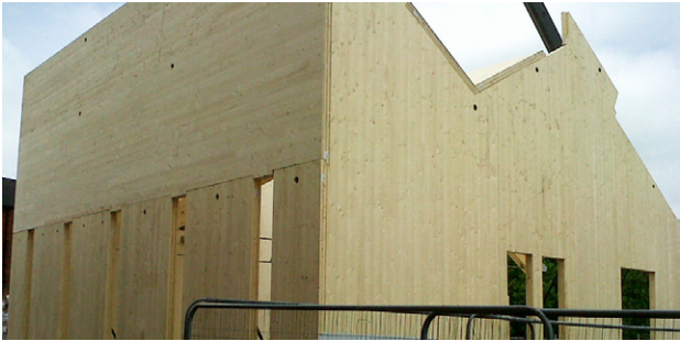
Leek College, Leek (UK)