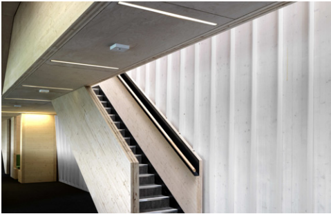
PLOT 35, Dartford (UK)