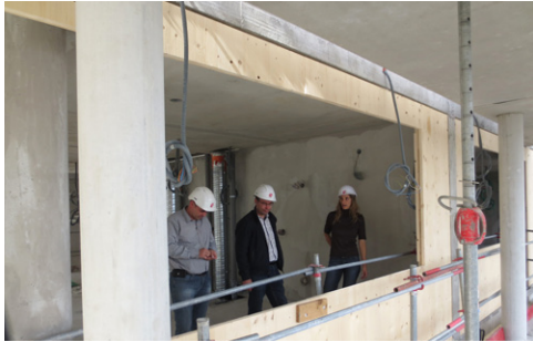
Escale Confluence, Lyon (FR)