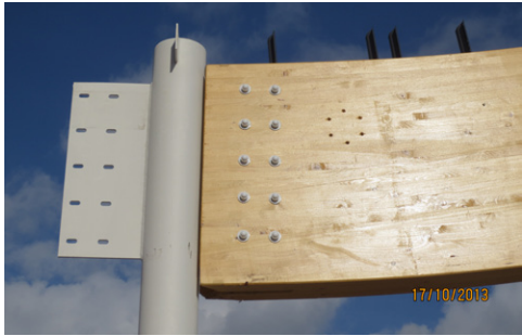
Paultons Park, Romsey (UK)