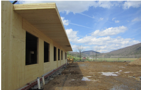
Franklin Elementary School, Franklin, WV (USA)