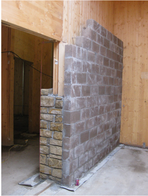
Langholm Primary School, Langholm (UK)