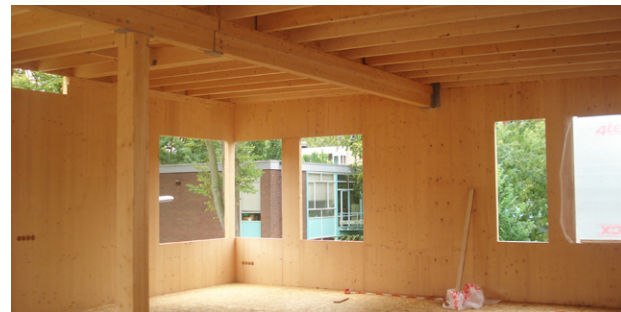
Nutsschool, Den Haag (NL)