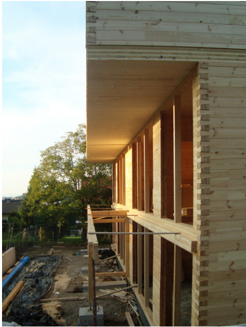
Wohnhaus Handlos, Pinsdorf (AT)